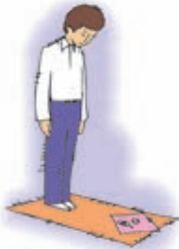
3. He's saying his prayers now.