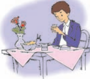
5. He's eating his breakfast.