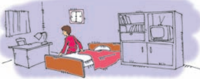
1. Ali's getting up now.

Listen to your teacher and repeat the sentences.