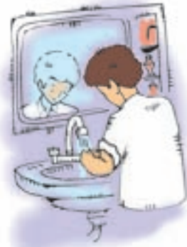
2. He's washing his hands and face.