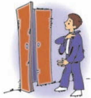
4. He's putting on his clothes.