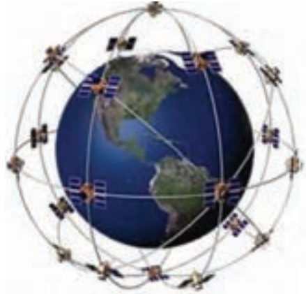
The Satellite Network

The GPS satellites transmit signals to GPS receivers. Each one transmits information about its position and the current time at regular intervals. All GPS satellites synchronize operations so that these repeating signals are transmitted at the same instant. These signals, traveling at the speed of light, are intercepted by GPS receivers. The distance to the GPS satellites can be determined by estimating the amount of time it takes for their signals to reach the receiver. When the receiver estimates the distance to at least four GPS satellites, it can calculate its position in three dimensions.