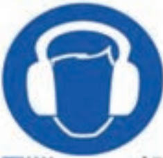
Wear ear protection