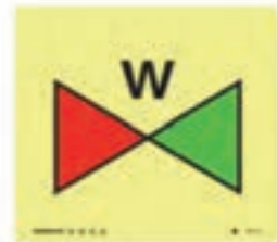
Fire main section valve